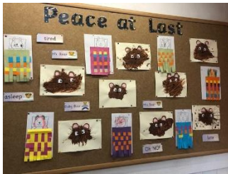
Robins Class lovely artwork based on this week's storybook "Peace at Last"